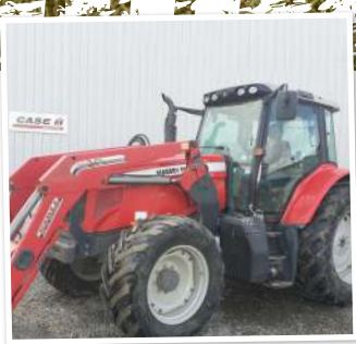
USED TRACTORS AND MACHINERY PAGES 15 - 17