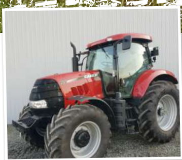
NEW TRACTORS AND MACHINERY PAGES 2 - 14